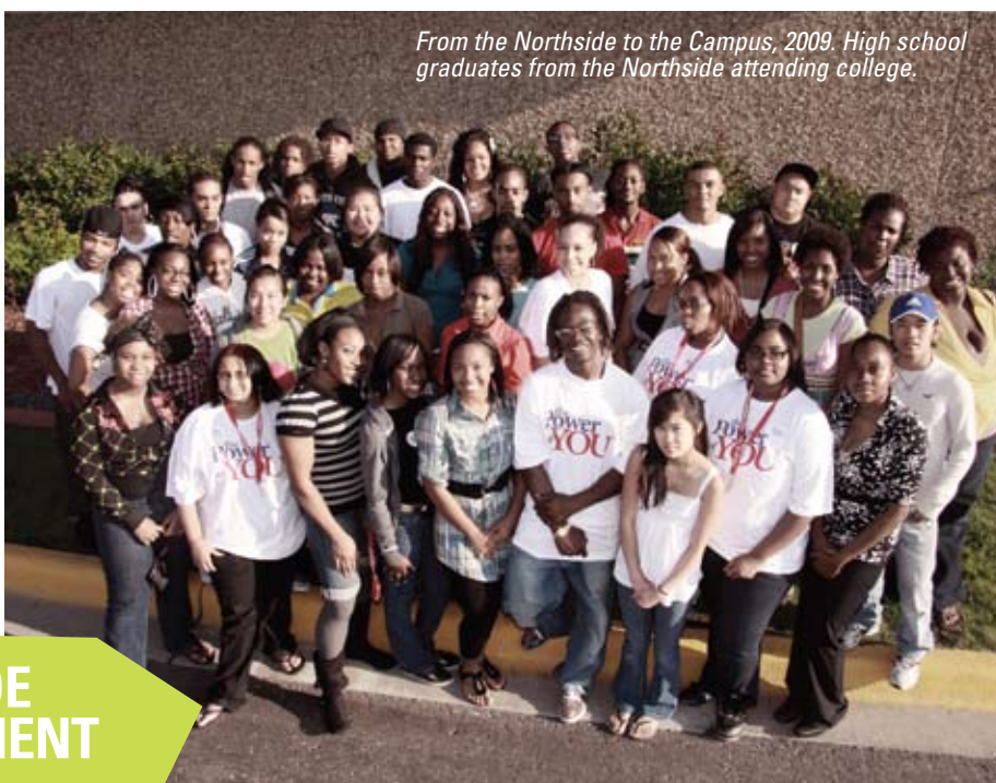
From the Northside to the Campus, 2009. High school graduates from the Northside attending college.

Minnesota has one of the largest achievement gaps in the nation between African-American and white children. In fact, the gap on fourth grade reading scores is the second largest in the nation ( Education Trust's Education Watch Minnesota Fall 2006 ). There is no place where the consequences of this achievement gap hits harder than in North Minneapolis.